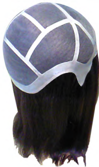
Lace wigs can be made from French lace, Swiss lace, on stretch fibre and even injected into bio skin.