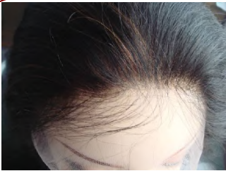
Hair is often bleached knotted and can be parted anywhere when knotted through a full lace wig.